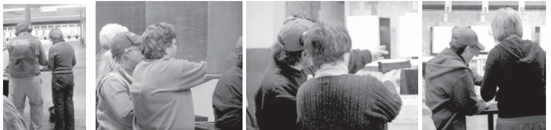
-Photos from Feb. 23rd Women On Target Class-