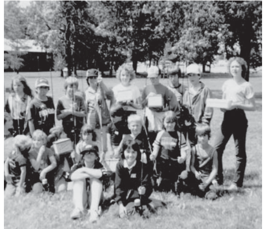
Photo of Fishing Derby around the 1970's If you have any info on this - let us know!